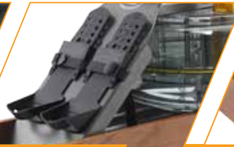
Height Adjustable Foot Plates