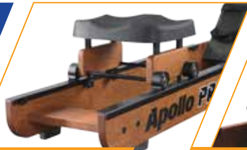
Self-Cleaning Wheel Mechanism