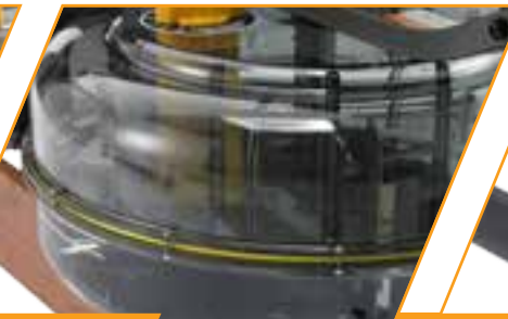
Triple Blade Impeller